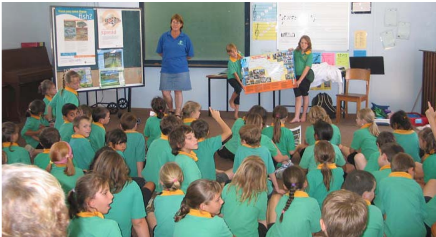
Dimbulah State School

MRWVG working in partnership with FNQ NRM, ACTFR, DPI&F, Mareeba Shire Council – visits and school talks have been done at most schools in the Catchment including Irvinebank, Dimbulah State School, Mutchilba State School, St Anthony’s Dimbulah, Mt Molloy (Chillagoe & Julatten still to come)